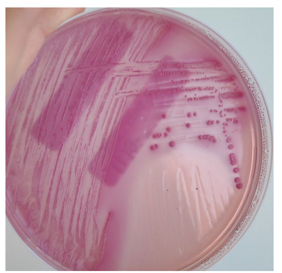
Figure 1. Typical appearance of E. coli on MacConkey agar supplemented with 1 mg/L cefotaxime.