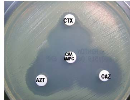
☒. Double-disk synergy test

IASR Indonesian Agency for Health Research and Development